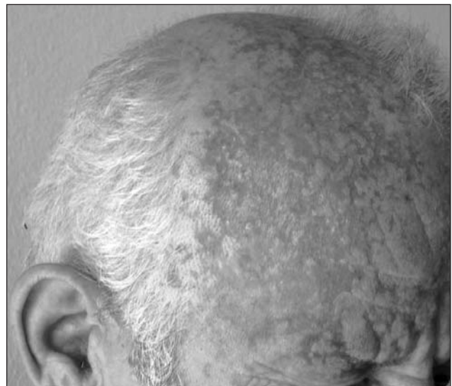
Figure 1: The patient's pseudobulloid-knobby lesions with red-brown color on the right side of his face.

The main clinical manifestations of bee venom poisoning are local allergic reactions at the site of the sting such as edema, erythema and burn-like