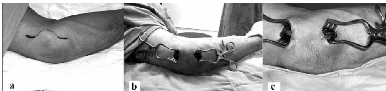
Figure 1: Operative view of the traditional loose omega type skin incision A) , proximal and distal mini skin incisions B) and the ulnar nerve C) at elbow.

Cubital Tunnel Syndrome is the second most frequent entrapment neuropathy in the upper extremity in adults. During its course in the arm and forearm, the ulnar nerve can be compressed at four potential sites (Figure 2) (27). The first site is in the arm where the ulnar nerve pierces the medial intermuscular septum and emerges from under the arcade of Struthers, that is located at approximately 8-cm. proximal to the medial epicondyle. The second potential site of compression is the ulnar groove between olecranon and medial epicondyle. The third site is the humeroulnar arcade (or the cubital tunnel), and the last potential site of entrapment is the exit point between the two heads of flexor carpi ulnaris. The roof of the cubital tunnel is a thick fibrous aponeurosis (arcuate ligament of Osborne) that connects the humeral